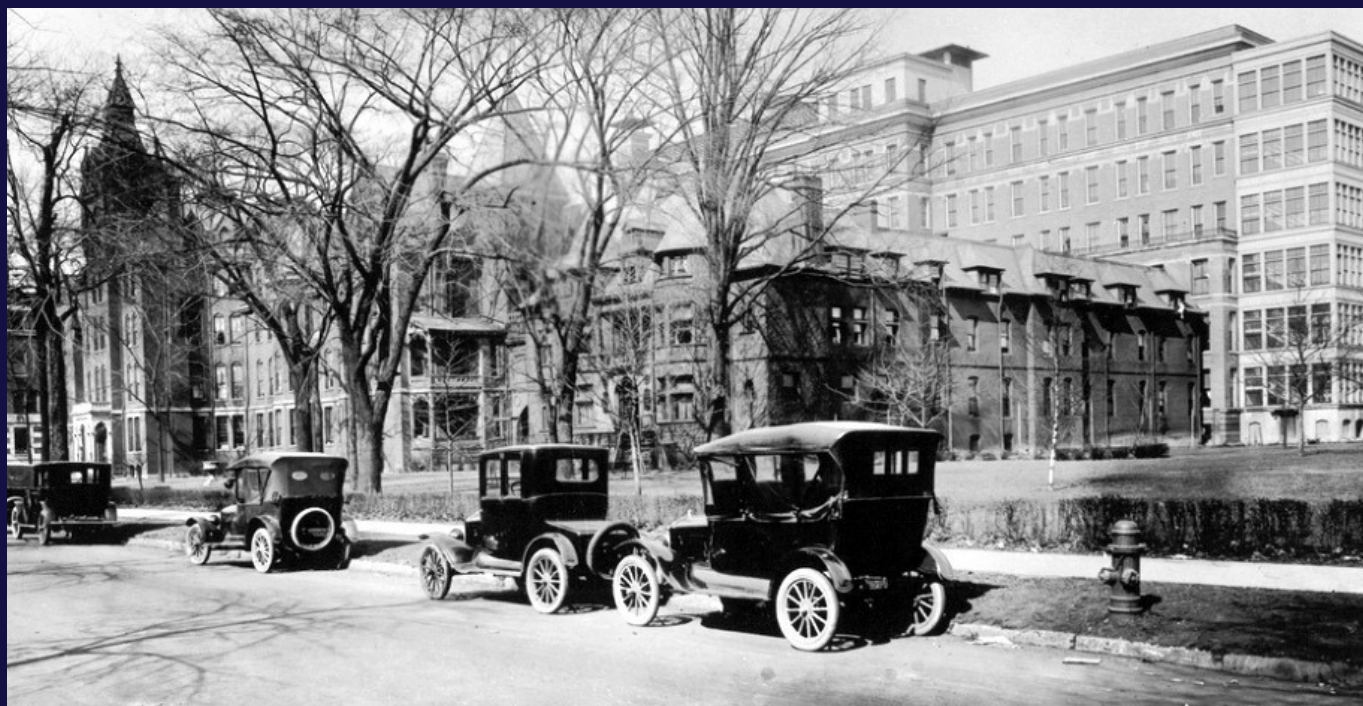
Harper Hospital circa 1920